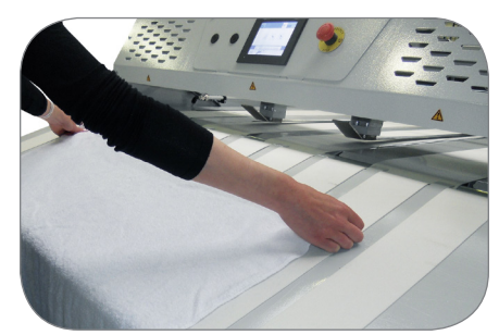
INDEPENDENT FEED TABLE

The FT MAXI folder incorporates a control and programming system. A system of easy-to-use icons guide the user in operating the machine.