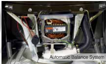
Automatic Balance System