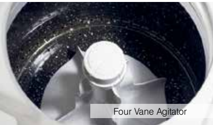
Four Vane Agitator

Laundry owners can pre-program Econ-O-Wash top-load washers for extended cycle times and waterfall fill for enhanced wash/rinse quality. Additionally, the machines offer two agitation and spin speeds for the ultimate in washing capability.