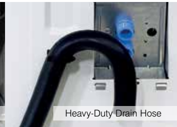
Heavy-Duty Drain Hose