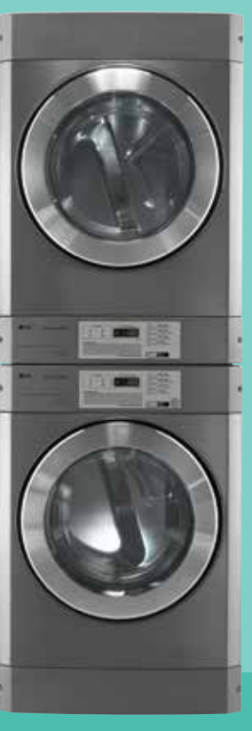
GD1329LGW2 – OPL Dryer (gas), Upper Stack GD1329LEW2 – OPL Dryer (electric), Upper Stack GD1329LGD2 – OPL Dryer (gas), Lower Stack GD1329LED2 – OPL Dryer (electric), Lower Stack