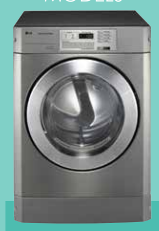
OPL Dryer (gas) GD1329LES2 – OPL Dryer (electric)