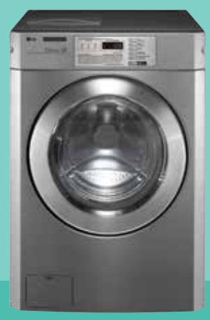
GCWP1069LS2 -OPL Washer