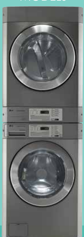
OPL Washer, Lower Stack GD1329LGW2 – OPL Dryer (gas), Upper Stack GD1329LEW2 – OPL Dryer (electric), Upper Stack