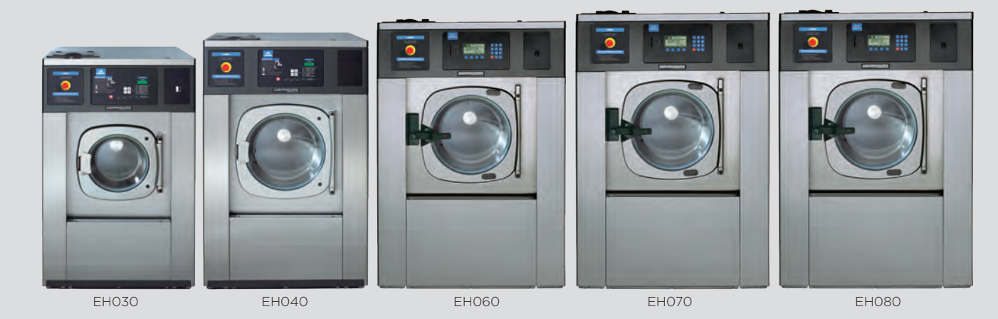
CONTINENTAL GIRBAU® A GIRBAU NORTH AMERICA BRAND

* Product specifications and details are subject to change without notice. For the most current and complete technical specifications, architectural line drawings and warranty information, please visit continentalgirbau.com. E-Series Washer-Extractors are available in 20- to 255-pound capacities.