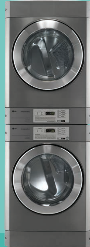
GD1329LGW2 – OPL Dryer (gas), Upper Stack GD1329LEW2 – OPL Dryer (electric), Upper Stack GD1329LGD2 – OPL Dryer (gas), Lower Stack GD1329LED2 – OPL Dryer (electric), Lower Stack