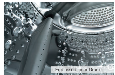
Embossed Inner Drum