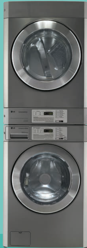
GCWP1069LD2 – OPL Washer, Lower Stack GD1329LGW2 – OPL Dryer (gas), Upper Stack GD1329LEW2 – OPL Dryer (electric), Upper Stack