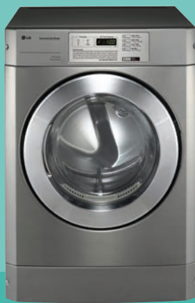
GD1329LGS2 – OPL Dryer (gas) GD1329LES2 – OPL Dryer (electric)