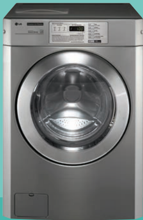
GCWP1069LS2 – OPL Washer